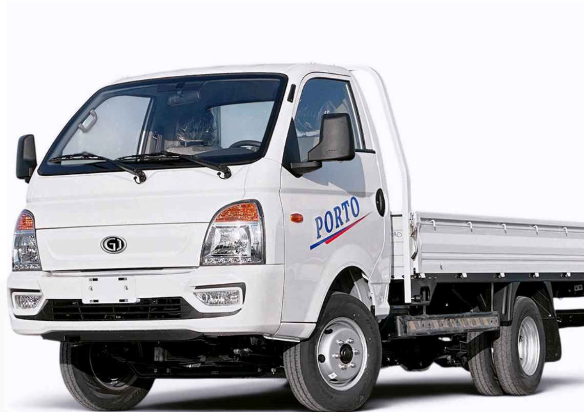
Exterior & Interior Views