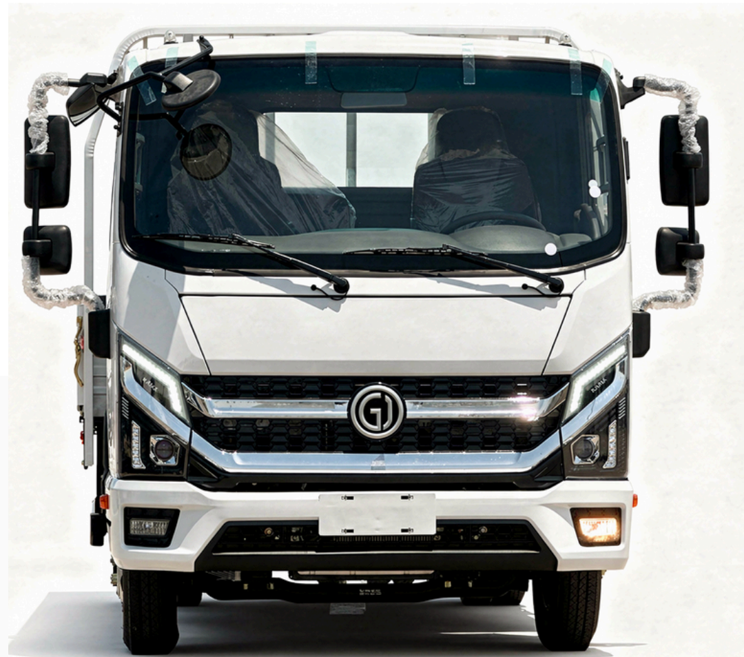
Exterior & Interior Views