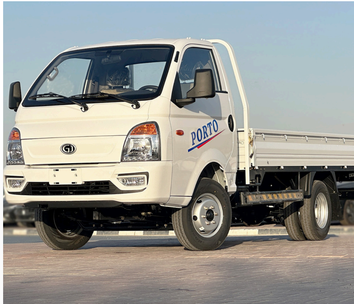
Exterior & Interior Views