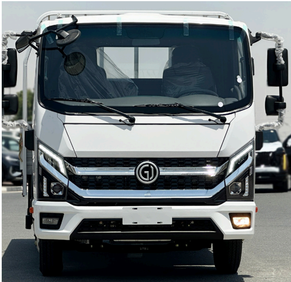
Exterior & Interior Views